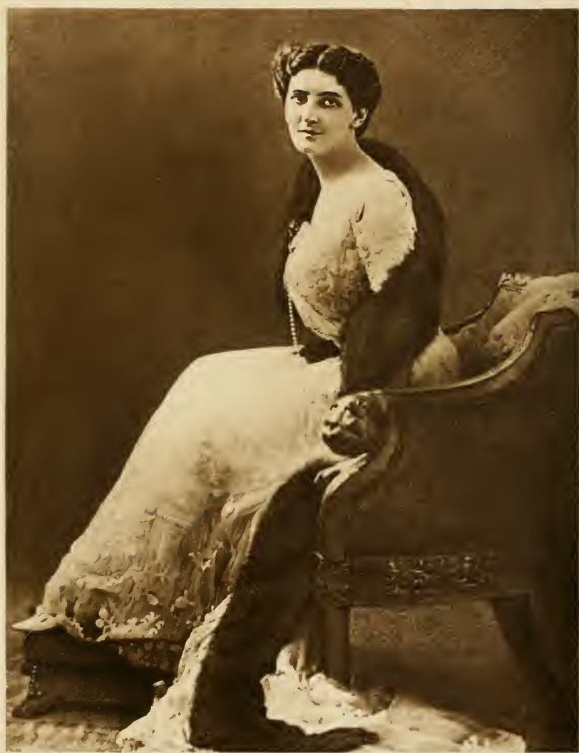
The late Lady Curzon.